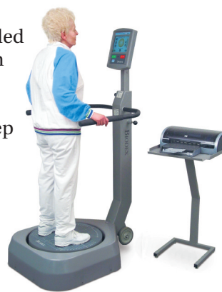
Biodex Balance System

Normal balance is controlled by a complex combination of visual, muscular and neurologic systems. Together, these factors keep us from falling when we encounter an unexpected disturbance. Testing and appropriate exercise will improve an individual's ability to remain upright under challenging conditions.